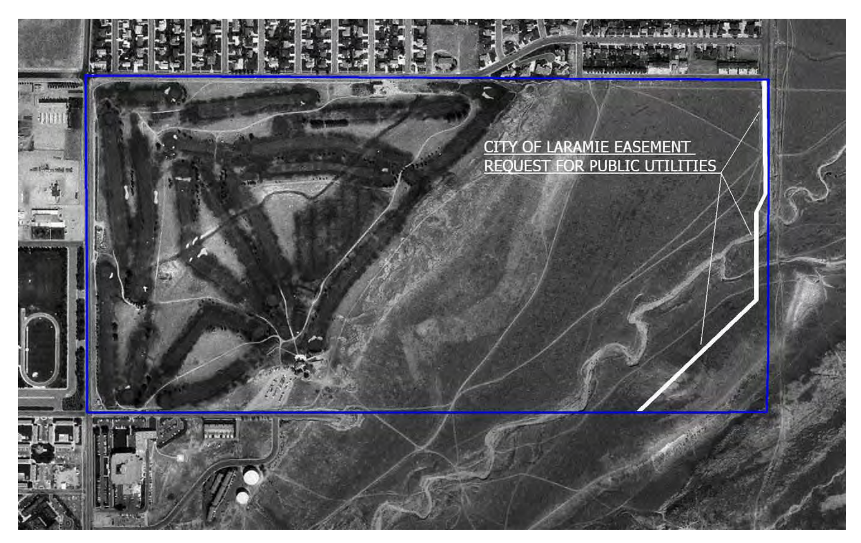
CITY OF LARAMIE EASEMENT REQUEST FOR PUBLIC UTILITIES (DATED 10/29/02)